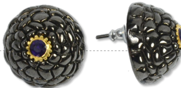
BLACK TWO LOVELY BERRIES EARRINGS