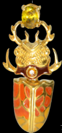
VALOUR BEETLE EARRINGS