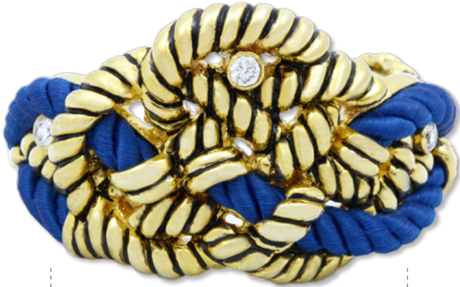
BLUE STRIP BEAUTEOUS CORD BANGLE