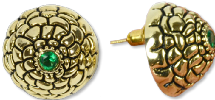
GOLD TWO LOVELY BERRIES EARRINGS