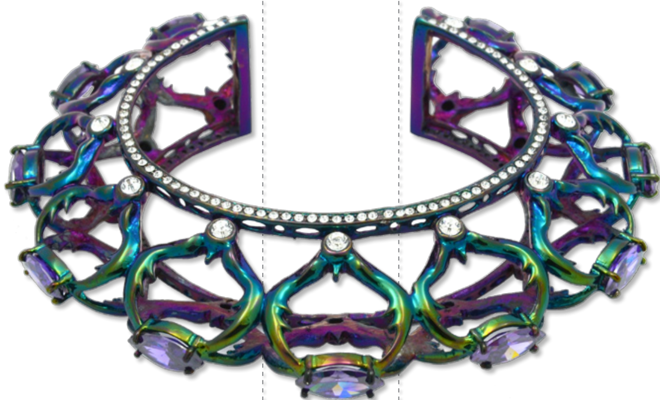
FLAMBOYANT GODDESS BANGLE