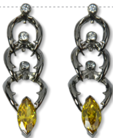
METALIC TRINITARIAN EARRINGS