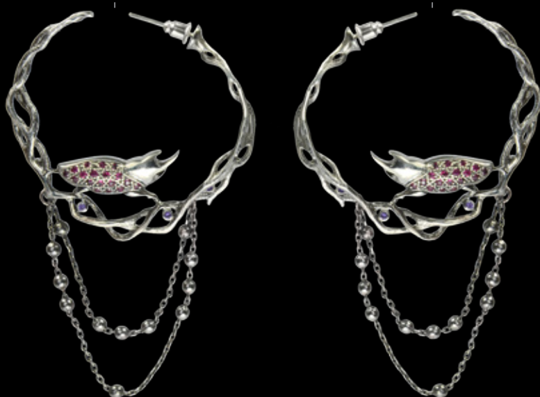
METALIC LUSCIOUS WOODBINE EARRINGS

Their intuition will be strong, and you will know how to maneuver in order to get what they want.