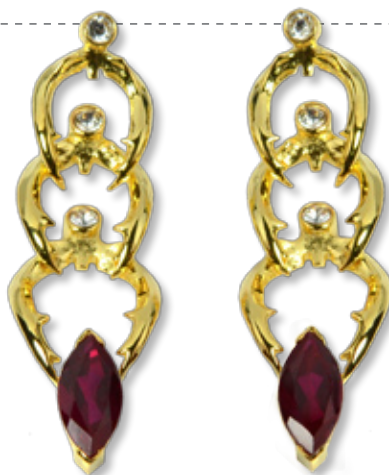
GOLD TRINITARIAN EARRINGS