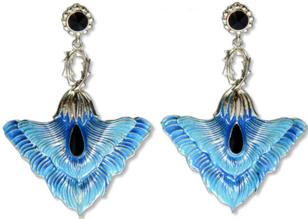
AZUR FELICITOUS PEACOCK EARRINGS