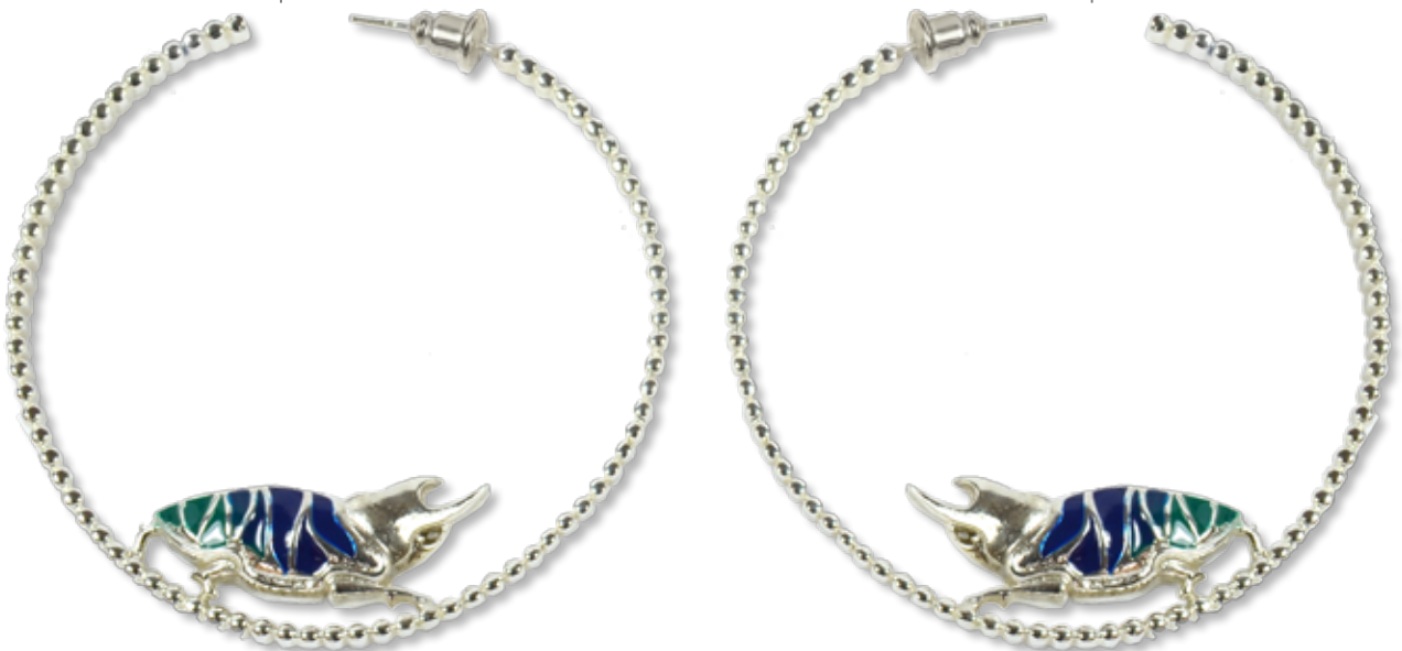
METALIC MANTRA WOODBINE EARRINGS