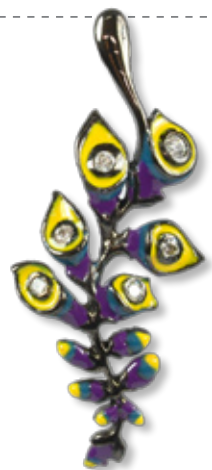
NIGHT BIRD OF PARADISE EARRINGS

Here's summer at its best! Joy and Happiness! All the ingredients will be here to allow you to get a better start in the perspective of life