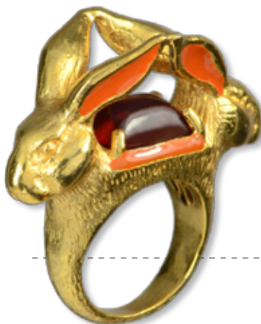
RUBY GOLD ROBIN GOODFELLOW RING