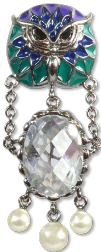
IMPERIAL OWL EARRINGS