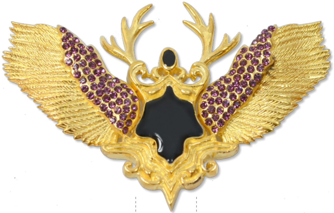
GOLD MAGNANIMOUS BROOCH