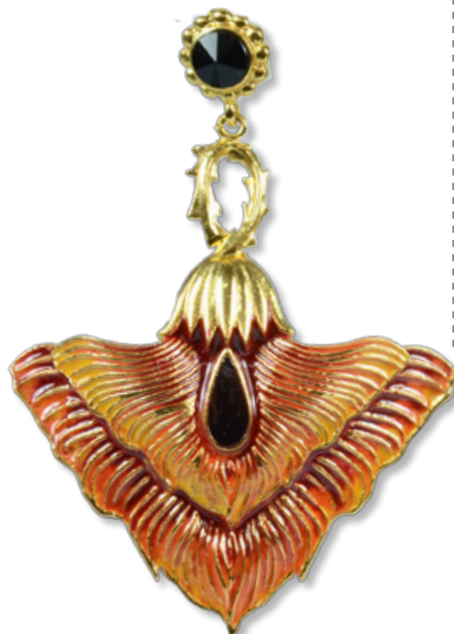
ORANGE FELICITOUS PEACOCK EARRINGS