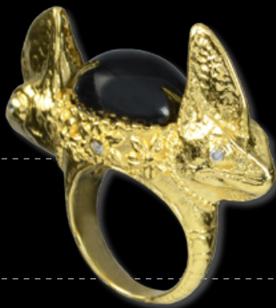
VIOLET PARLOUS CHAMELEON RING