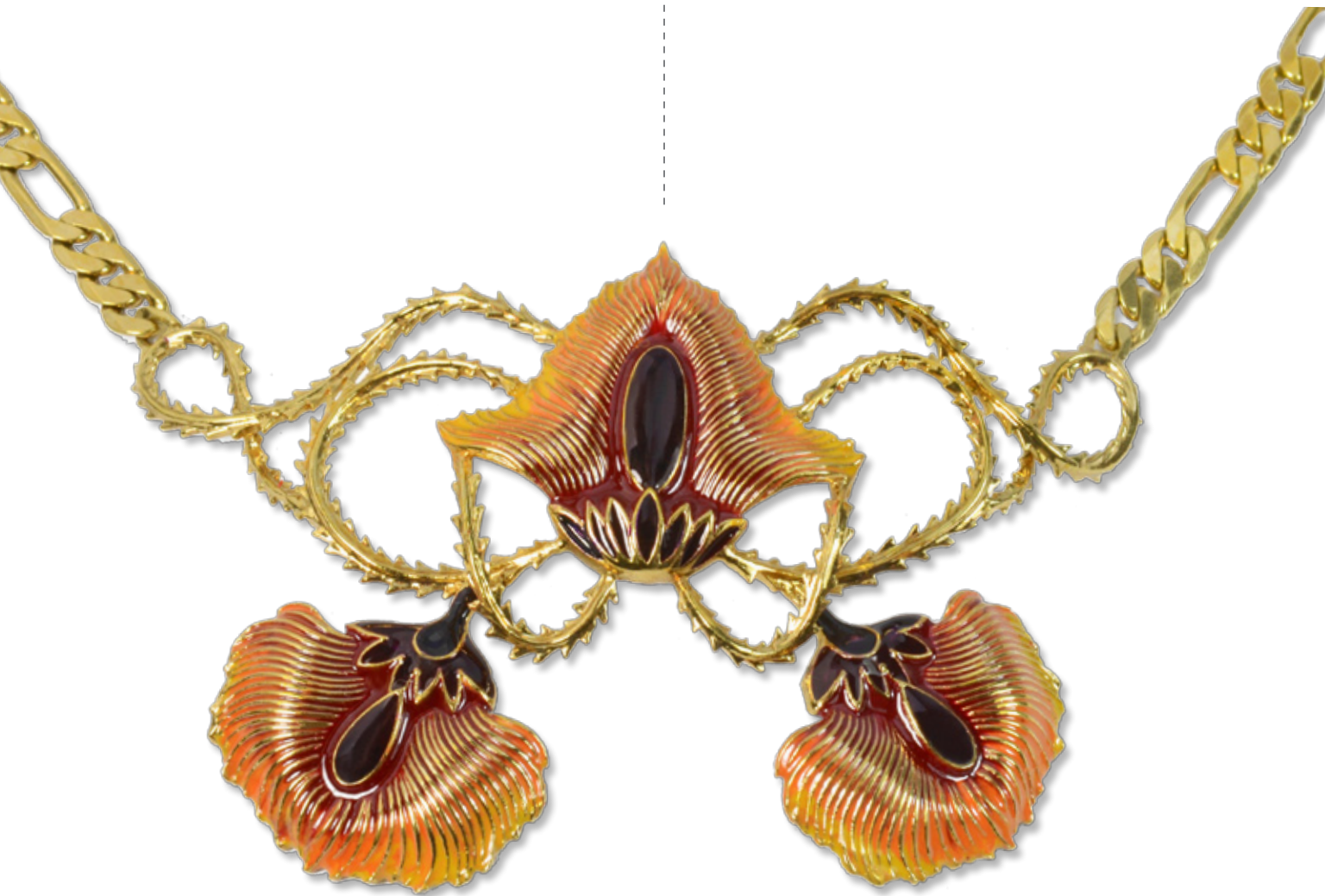
GOLD FELICITOUS PEACOCK NECKLACE