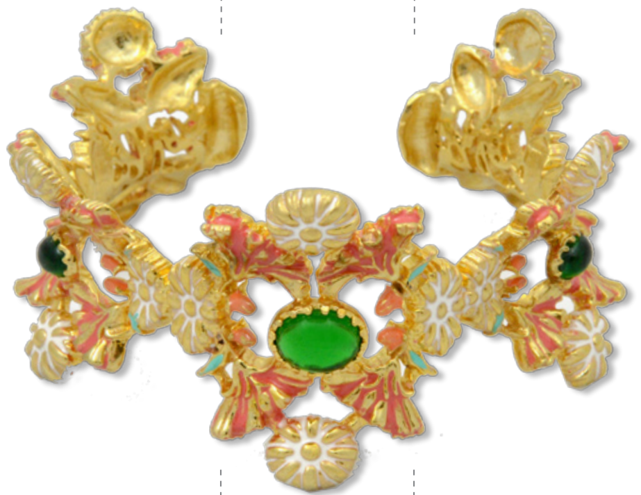
FLOWER DE LUCE BANGLE