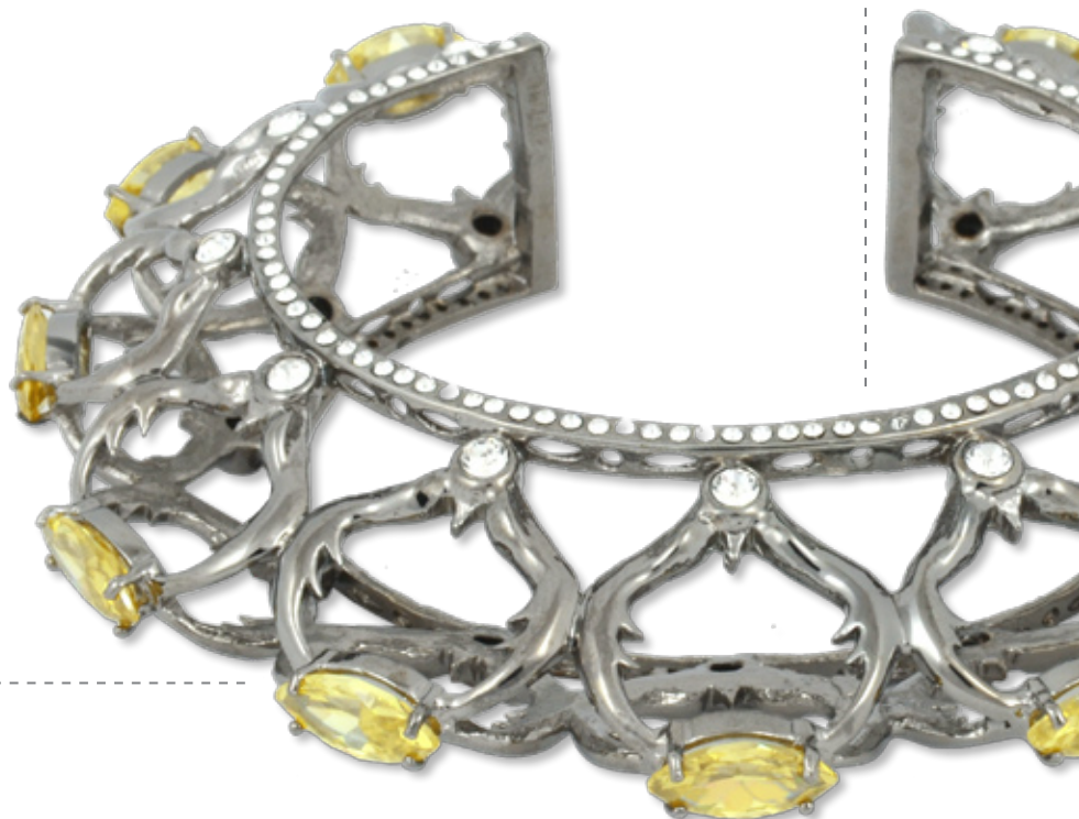
FLAWLESS GODDESS BANGLE