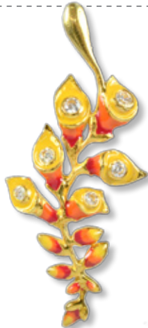
ORANGE BIRD OF PARADISE EARRINGS